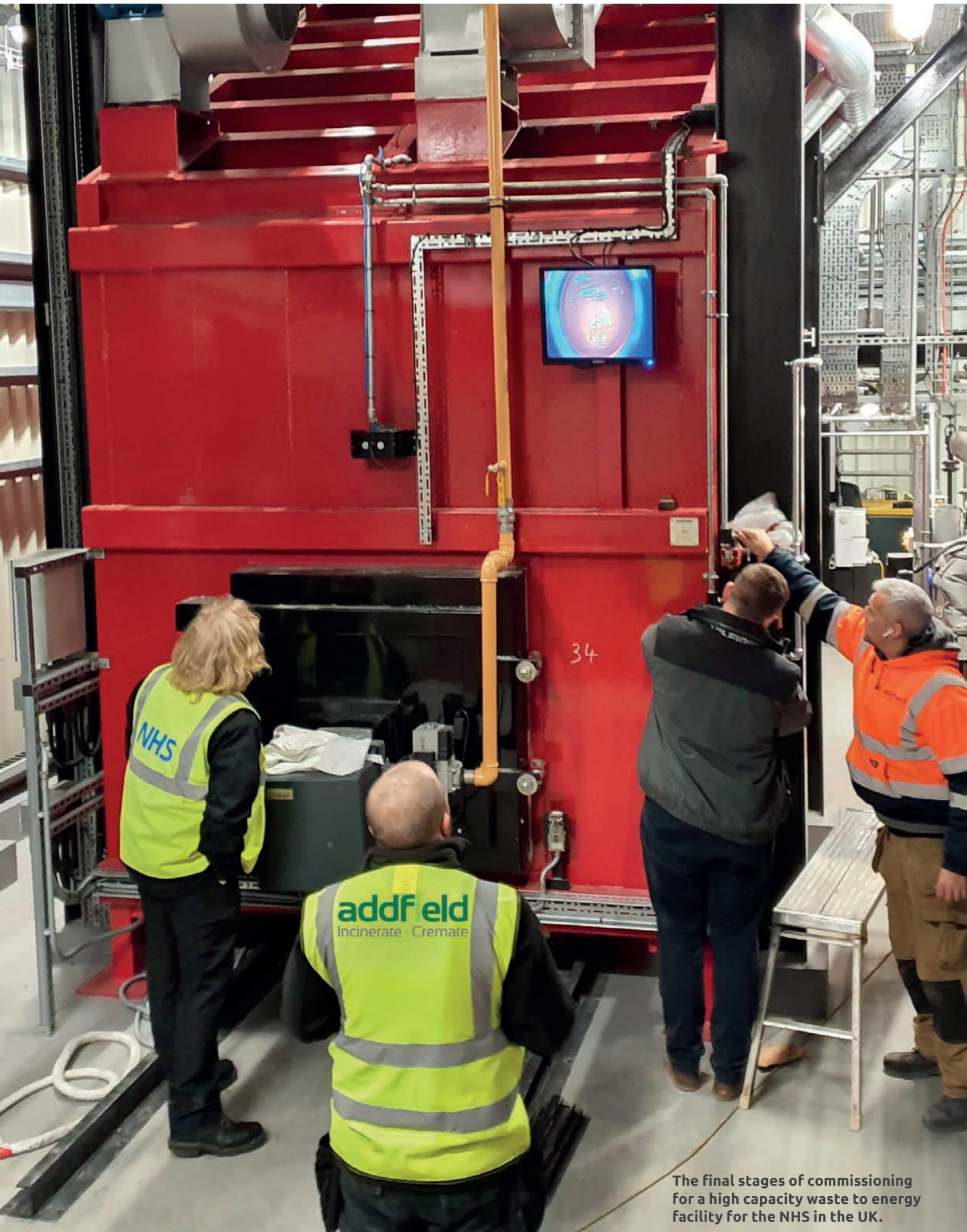
The final stages of commissioning for a high capacity waste to energy facility for the NHS in the UK.