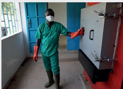
Safe to operate throughout the cycle

When the current management team took control in 2008 Addfield only produced a handful of machines a year for the UK agricultural market. Since then we have expanded from having only three employees to over sixty through sustainable growth. This has been achieved through expanding into new markets and countries gradually. Each expansion is scrutinised for impact on the business and future potential, avoiding growing too fast into immature markets.