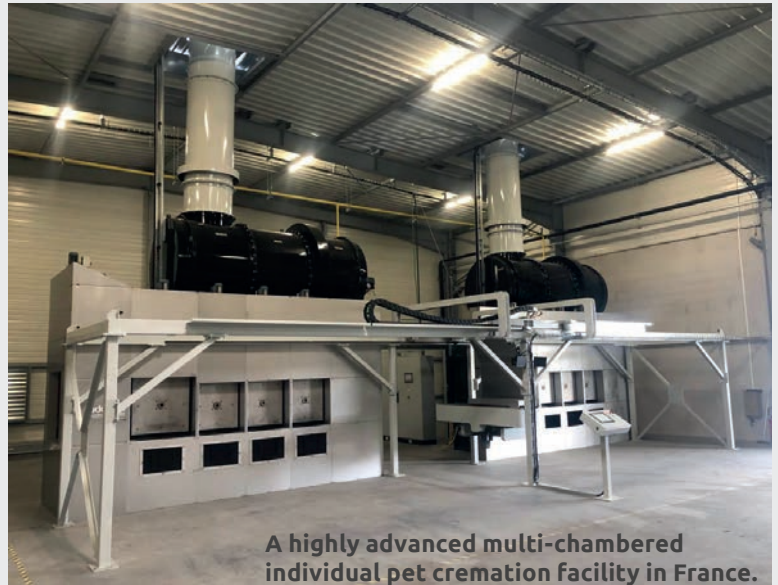
A highly advanced multi-chambered individual pet cremation facility in France.