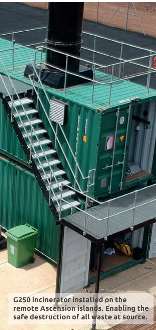
G250 incinerator installed on the remote Ascension islands. Enabling the safe destruction of all waste at source.