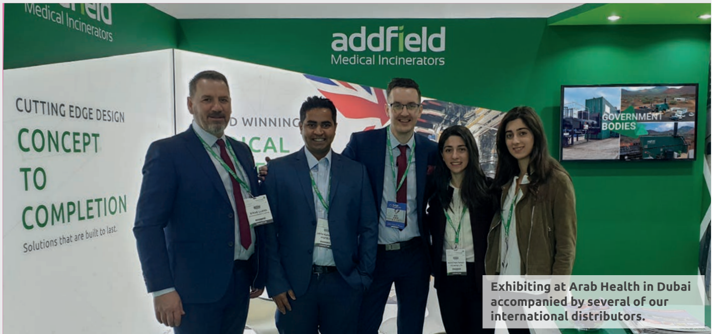
Exhibiting at Arab Health in Dubai accompanied by several of our international distributors.

a dedicated factory councillor ensuring everyone has a voice in departments that traditionally can be overlooked, further improving employee satisfaction and allowing us to learn from the front lines adapting and improving rapidly. Additionally, we introduced a team of 'Mental Health' first aiders on hand for all proving especially valuable through the added strains caused by Covid19.