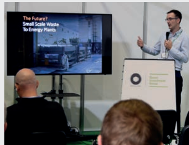
Delivering insights on Waste to Energy to industry peers.