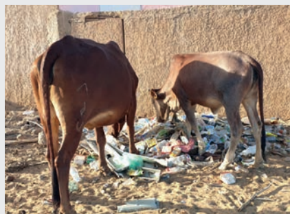
Livestock grazing discarded medical waste

We believe clean air and a safe environment to live in are basic human rights and consider all installations as if they were in our own back garden.