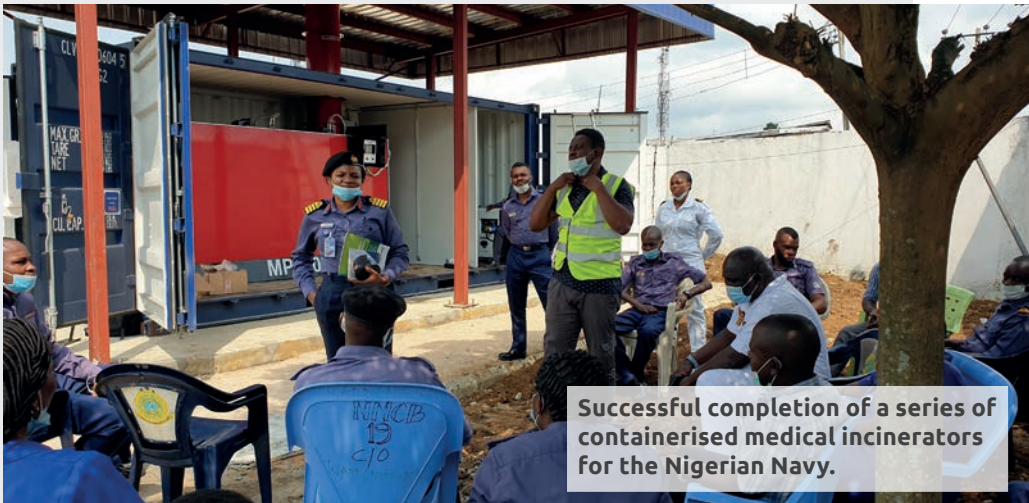
Successful completion of a series of containerised medical incinerators for the Nigerian Navy.

When the current management team took control in 2008 Addfield only produced a handful of machines a year for the UK agricultural market. Since then we have expanded from having only three employees to over sixty through sustainable growth. This has been achieved through expanding into new markets and countries gradually. Each expansion is scrutinised for impact on the business and future potential, avoiding growing too fast into immature markets.