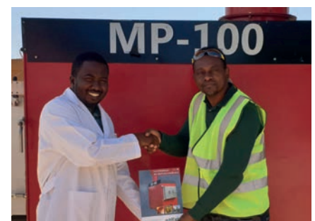
Our North African distributor after delivering full training in the MP100

Although health benefits may not be widely associated with incineration, correct medical waste disposal helps save lives across developing countries. We have become the preferred supplier to international aid agencies, in turn leading to installations across dozens of sites, disposing of vaccine and hospital waste. 2021 brought home how essential it is for clinical waste to be disposed of correctly. Developing countries with poor facilities particularly feeling the impact of the tsunami of waste generated as a result of the pandemic. During 2021/22 we prioritized the production of medical incinerators for these customers over all other orders.