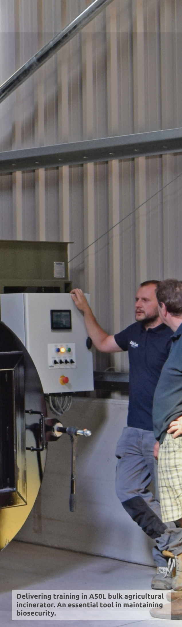
Delivering training in A50L bulk agricultural incinerator. An essential tool in maintaining biosecurity.