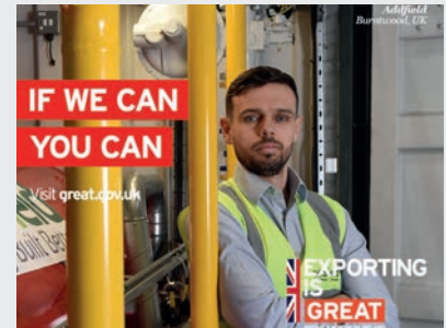
Active members of the DIT Exporting Champions project since 2019.

Proud of the impacts we have seen achieved through exporting. We had this validated in 2018 by the Department of International Trade (DIT), receiving the Board of Trade award. Following which we have become ambassadors for the DIT since 2019 as part of their exporting champions program. Mentoring businesses across the West Midlands, delivering workshops supporting them to begin exporting, sharing our experiences helping to amplify the