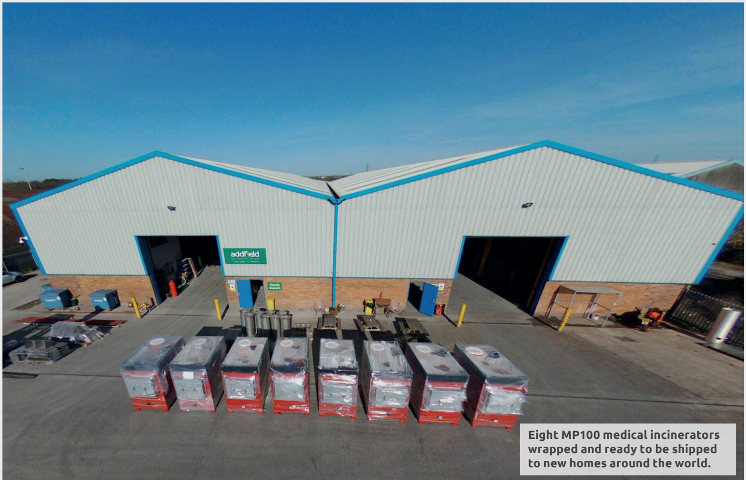
Eight MP100 medical incinerators wrapped and ready to be shipped to new homes around the world.

We are incredibly proud of the impact we have had in the past 40 years and will continue with our motto of being, 'Simply Built Better'.