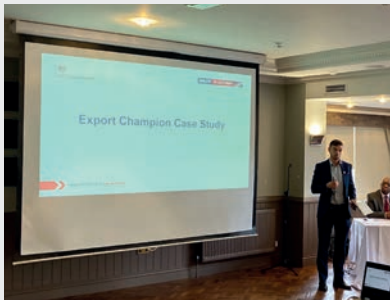
Promoting post Brexit exporting for the Chamber of Commerce.